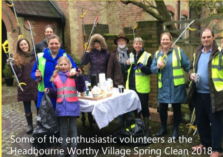
Some of the enthusiastic volunteers at the Headbourne Worthy Village Spring Clean 2018

Join us for the next Village Spring Clean on Saturday 9 th March from 10am. We meet at Marlands on London Road to collect high vis jackets, litter-pickers and bags, and share a welcome coffee and biscuits, before moving out to sites across Headbourne Worthy and Kings Barton to give our community a good Spring Clean! All welcome - but of course children must be supervised by a responsible adult.