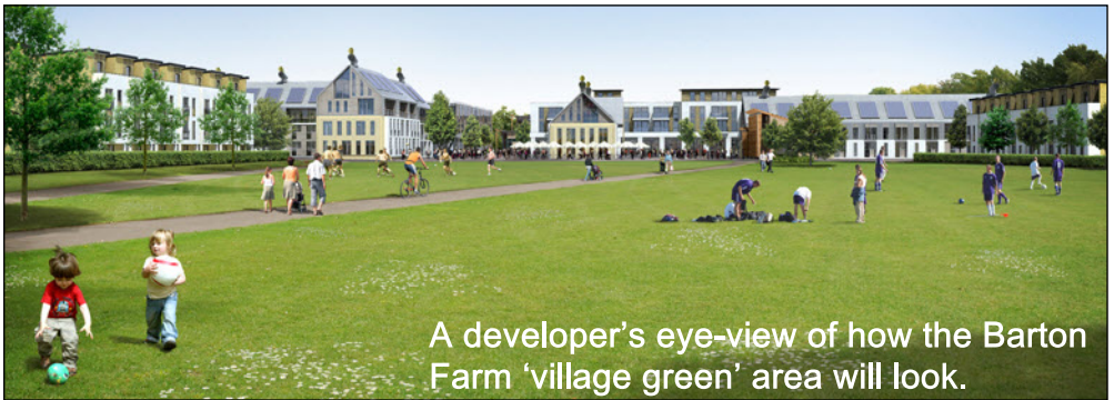
A developer's eye-view of how the Barton Farm 'village green' area will look.

As a Parish, we need to think about many issues to do with our identity and the impact of traffic. For instance, what is your view of the Parish Council's idea that the railway bridge at Wellhouse Lane should be closed to vehicular traffic (but open to pedestrians, horses and bicycles)? Please let our Parish Clerk know.